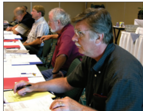
Workshop managers have worked and sometimes struggled to maintain quality services for people with disabilities. Staying abreast of changing regulations, technology and markets is a key.