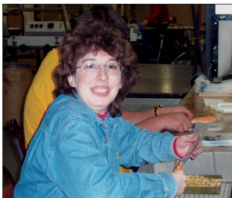
Workshops provide a wide range of services, but none is more important than services to people with disabilities. By providing a wide range of employment options, workshops serve communities across the state. And by doing this with a majority of funds derived business contracts, workshops ensure these options are delivered in a sustainable way.