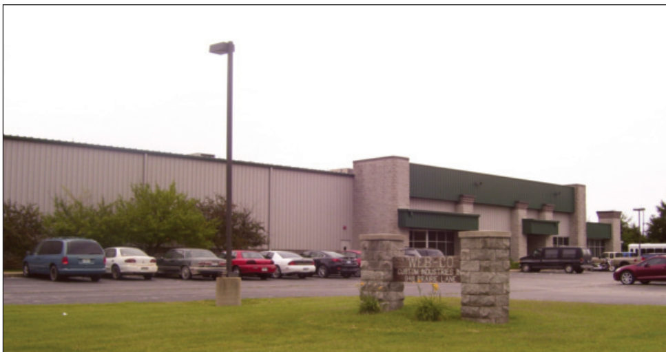
Workshops have developed into modern facilities that serve both the business community and people with disabilities. This is Web-Co's facility.

The majority of workshop employees have a developmental disability. Other common disabilities include mental illness, head injury, blindness, deafness, seizure disorders and physical disabilities. Prior to being hired for employment in the workshop, people must be assessed by the Division of Vocational Rehabilitation