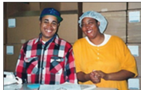
Workers enjoying time at Project Inc. in one of the early scenes from one of the first shops to open in the state.

County and state funding does fill a critical gap from higher overhead for workshop supervision and other services