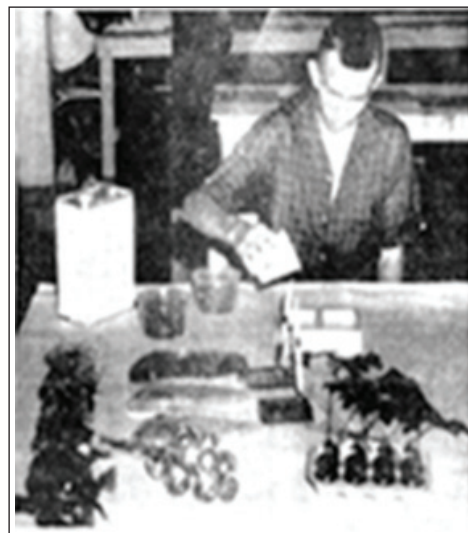
This early photo captured a worker in Missouri's first "official" workshop, Cooperative Workshop in Sedalia.

• 1977-1987, Doco, Web-County Custom Industries, Worth Industries, Tanton Industries, Three Rivers Industries, River Bluff Industries, Enterprises United, Jeff-County Subcontracting, Ideal Industries, Pemiscot Progressive Industries, Helping Hand, Cass County Area Workshop, ITE, Lake Area Industries, Big Springs, Canterbury Enterprises, Christian County Enterprises, Nocomo Industries, Oregon